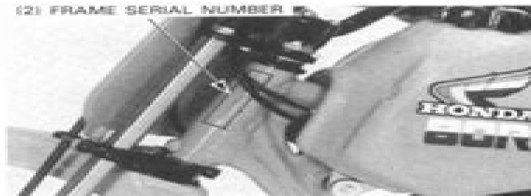
(2) FRAME SERIAL NUMBER

The frame serial number is stamped on the left side of the steering head.