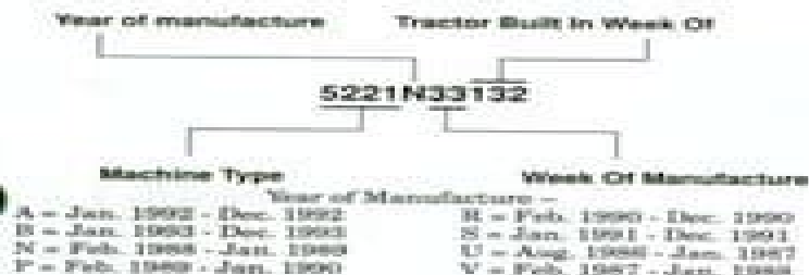
Fig. 3—The tractor serial number identifies machine type, year of manufacture, week of manufacture during specific year, and specific unit manufactured during that week. The illustration shown identifies a two-wheel-drive 360 tractor which was the 132nd tractor manufactured during the 33rd week of 1988.