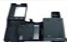
Upper Deck-Center. 1P