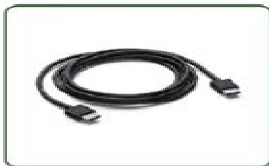
HDMI Cable x1