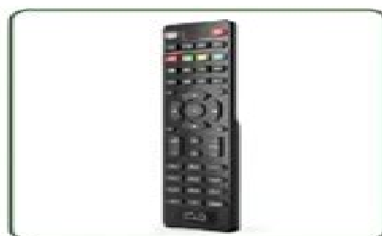
Remote Control x1