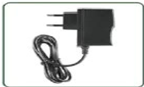
EU Power Adapter x1