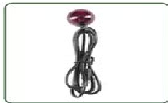
IR Receiver x 1