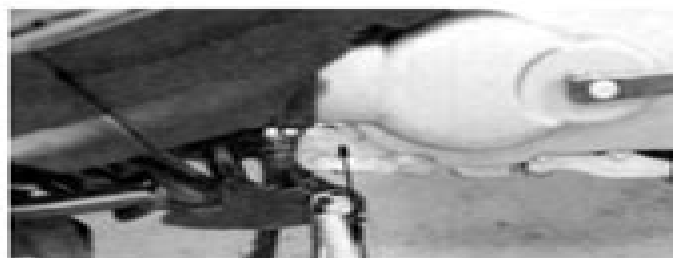
Location of Engine Serial Number