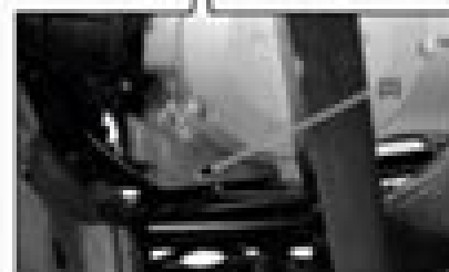
(2) Location of Engine Serial Number