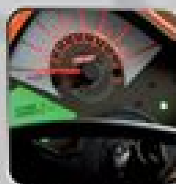
Tablero analógico digital