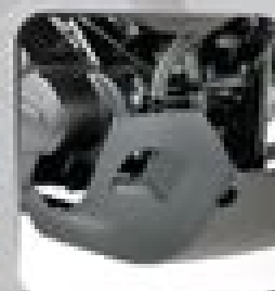
Protector de motor