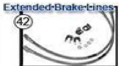
Extended Brake Lines