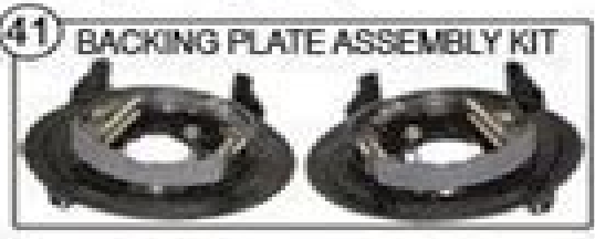
BACKING PLATE ASSEMBLY KIT