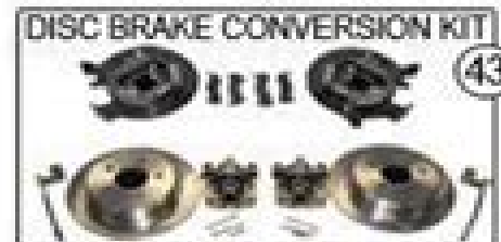
DISC BRAKE CONVERSION KIT