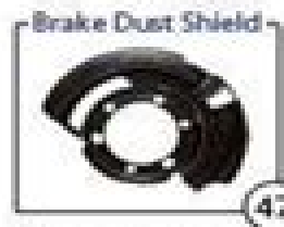
Brake Dust Shield