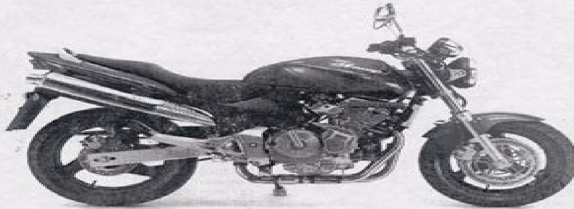
FRAME SERIAL NUMBER