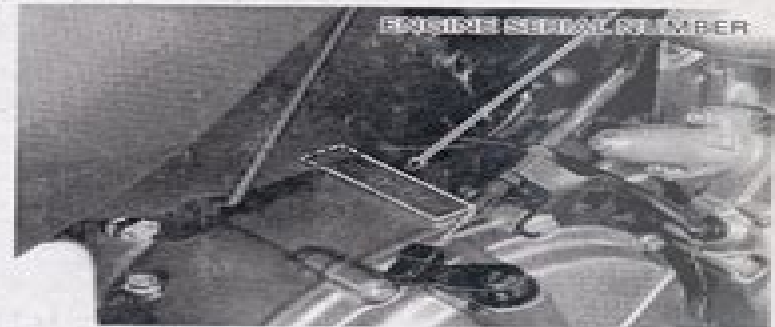
ENGINE SERIAL NUMBER