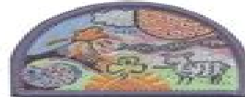
Science and Technology