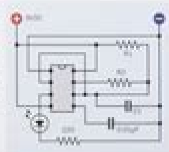
Figure 9-17 In previous configurations, the potentiometer can adjust the duty cycle and frequency.

charges only through R_2 . However, in this configuration the capacitor is discharging into a variable divider created by the two resistors. Slight adjustments of the resistor values may be necessary before the duty cycle is precisely 50%.