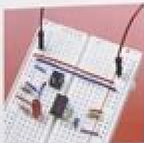
Figure 9-13 The basic 555-timer configuration for a 50% duty cycle in astable mode