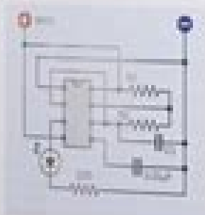
Figure 9-14 A 555 timer with variable component values, configured to create a 50% duty cycle in astable mode

A basic schematic for a 555 timer operating in an astable mode is shown in Figure 9-13. Once again, an LED is attached to the output for demonstration purposes. If the pulse width exceeds the period of the pulse, a small loadspeaker can be used instead, in series with a 470-ohm resistor and a 100-ohm capacitor.