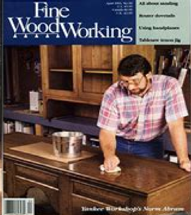
Teacher Workshops' Norm Abram