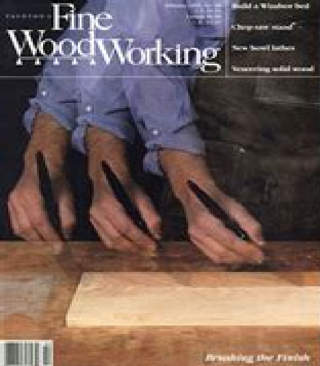
Brushing the Finish