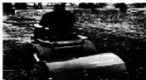
MF 650 PTO ROTARY TILLER