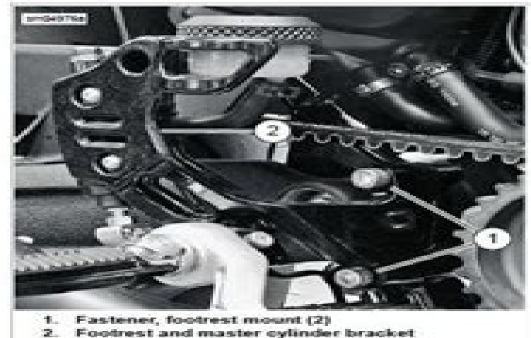
Figure 3-20. Right Footrest and Rear Master Cylinder