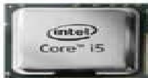
(d) Core i5 Processor [16]