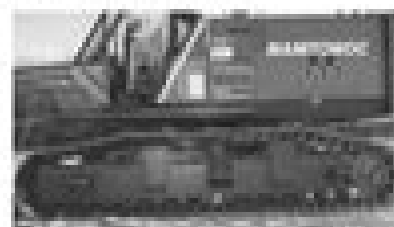
30 Boom Support for boom and multiplier of mechanical force