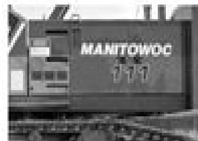
30 Boom Support for boom and multiplier of mechanical force. Used with multiplier and boom system to raise and lower boom and to add small crane counterweights.