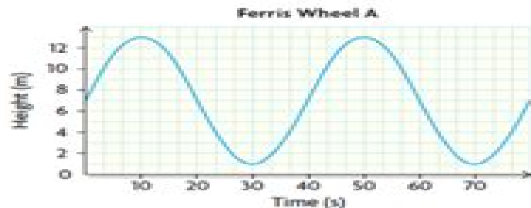
Ferris wheel A

Example: Two Ferris Wheels are at a country fair. Answer the following questions for each of the following graphs: