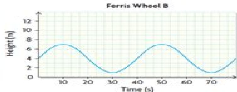
Ferris Wheel B