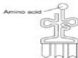
a. Transfer RNA

2. On the lines provided, identify each kind of RNA.