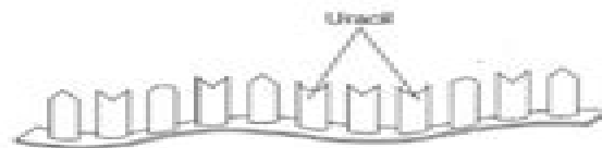
b. Messenger RNA