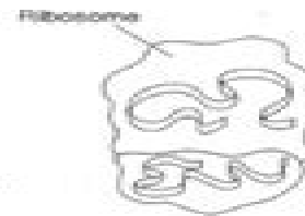
c. Ribosomal RNA