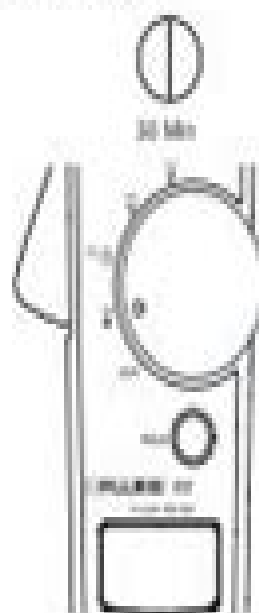
Figure 100-1 - continued