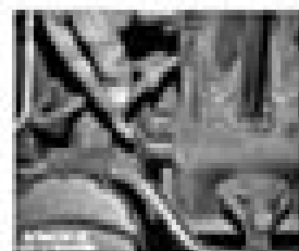
4.14 Disconnect the coolant hose