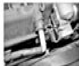
4.13a Release the locking collar completely for the location hole