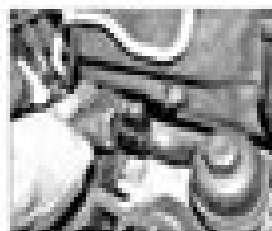
4.15 Disconnect the coolant hose