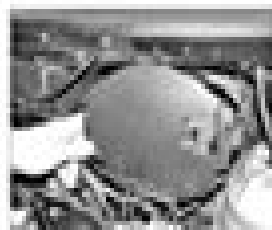
4.17a Remove the ECM cover