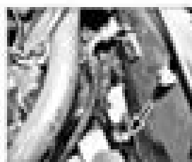
4.11 Disconnect the hoses - proceed