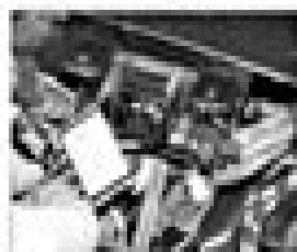
4.17b ... and disconnect the wiring from the timer plug

cable from the right-hand front engine mounting See Illustrations