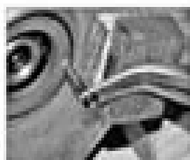
15.1c ... and push the seal out from the cover