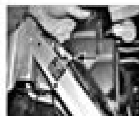
4.10 Disconnect the timing belt - proceed