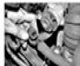
4.16 Disconnect the oil hose