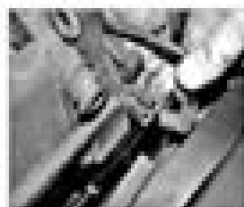
4.13b Put off the vacuum hose to disconnect