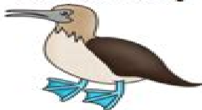
4 Blue-footed Booby