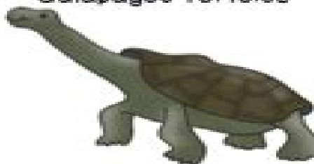
5 Galapagos Tortoise