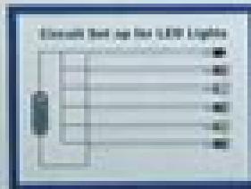
Downloaded At: 11:53 11 September 2009