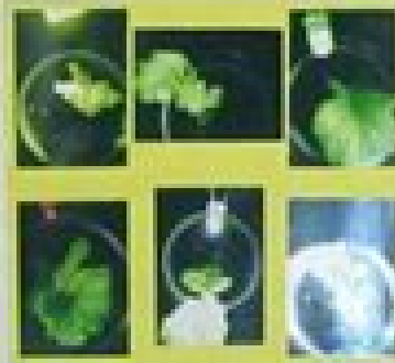
Student Managerial and Learning Student Inquiry