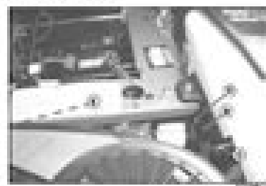
Figure 10-3: Z200 shown, Z200 model.