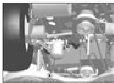
Figure 10-1: View from rear of machine.