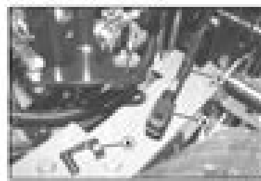
Figure 10-4: Z200 shown.

5. Remove tracking pin(s) on drive sprocket (A) and (B). Then remove sprocket and turn sprocket (A). Tighten drive sprocket and on sprocket (B) if necessary. If necessary, decrease forward sprocket and on sprocket (B) if necessary. Repeat procedure, as necessary, on opposite side (B). Install sprocket and turn sprocket and secure with locking pin.