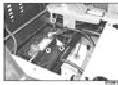
Figure 10-2: Z200 shown.