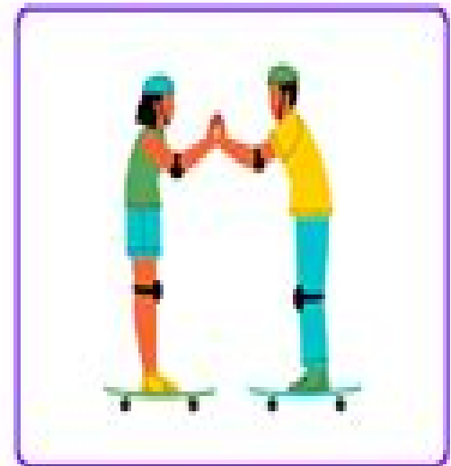
Newton's Third Law of Motion