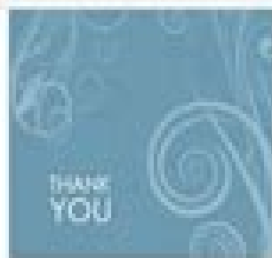
Thank you cards