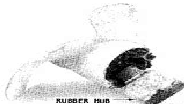
Example of a damaged propeller. This unit should have been replaced long before this amount of damage was sustained.