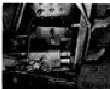
Fig. 7 - Brake Master Cylinder

Disconnect brake stop light switch 2 at master cylinder.