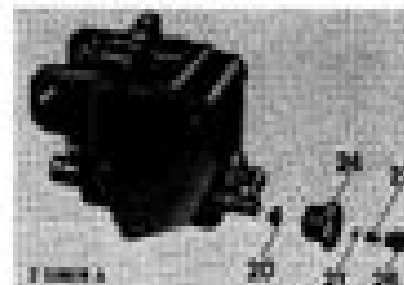
Fig. 8 - Master Cylinder, Disassembly

Unimount adaptor 20 (Figs. 8 and 9) out of valve seats 24 and remove balls 21 and springs 22 which are now released. Unimount valve seats 24 out of master cylinder and remove spring cups 23. With-draw pistons and springs from master cylinder. Remove plug and screws from top of master cylinder and withdraw check valves.