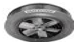
Models VVN Vertical Delivery