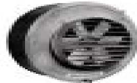
Model PTPTM "Power-Throw"