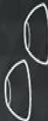
S / M / L (SEALING EAR TIPS)