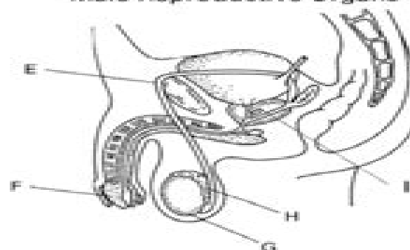
Male Reproductive Organs