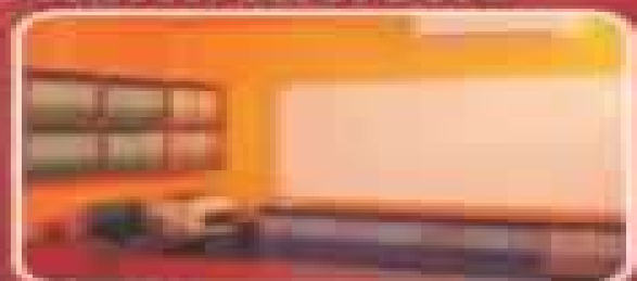
Learning facilities at Benchmark

Benchmark is focused on exceptional academic performance. Parents/Guardians are invited to arrange an appointment with the Director-Academic for an initial discussion.