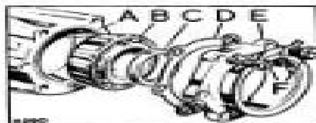
Fig. 11-41.- Caja del molin de acero y cajíneta.

1.05.- Separar la arandela distanciadora, C, y el cajíneta, B, del árbol del píñón, A.