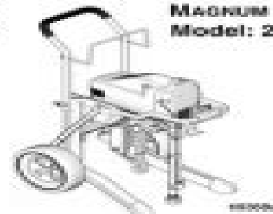
MAGNUM ProX9 Model: 261820