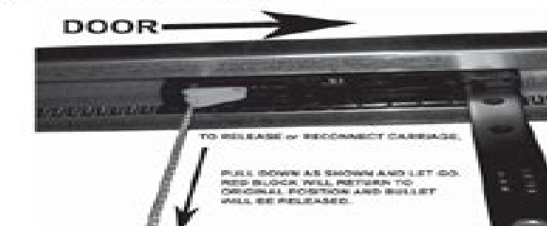
FIG. 6-3 Carriage Release

TO RECONNECT CARRIAGE: 1. Verify RED block is in the UP position. 2. Manually move door until carriage engages bullet. 3. Raise or lower door using remote or wall console.