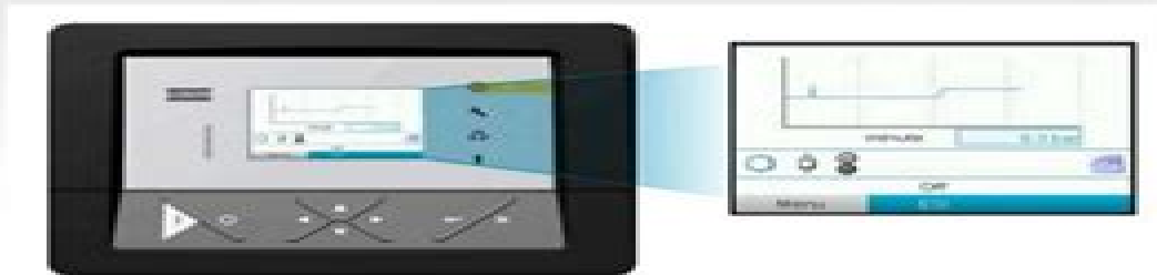
Real time trending

The superior processing capability of the Elektronikon® Mk5 enables a compressor of almost any age or type to benefit from the latest and most advanced control algorithms and functionality, resulting in improved system control and energy savings.