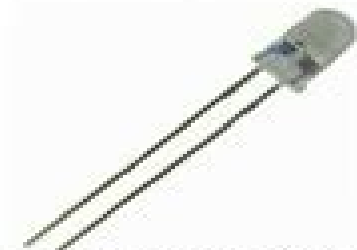
Light Emitting Diode