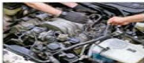
Bentley technical editors removing intake manifold on V6 (M 112) engine.

The do-it-yourself Mercedes-Benz owner will find this manual indispensable as a source of detailed maintenance and repair information. Even if you have no intention of working on your vehicle, you will find that reading and owning this manual makes it possible to discuss repairs more intelligently with a professional technician.