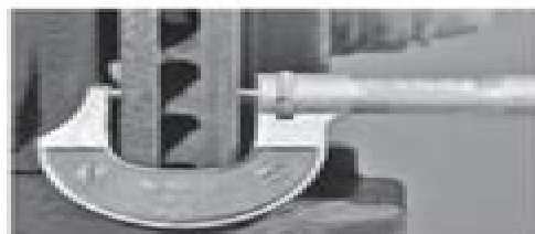
Measuring brake rotor wear. 00.04 Maintenance