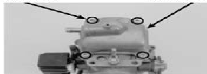
CUBA DA BÓIA