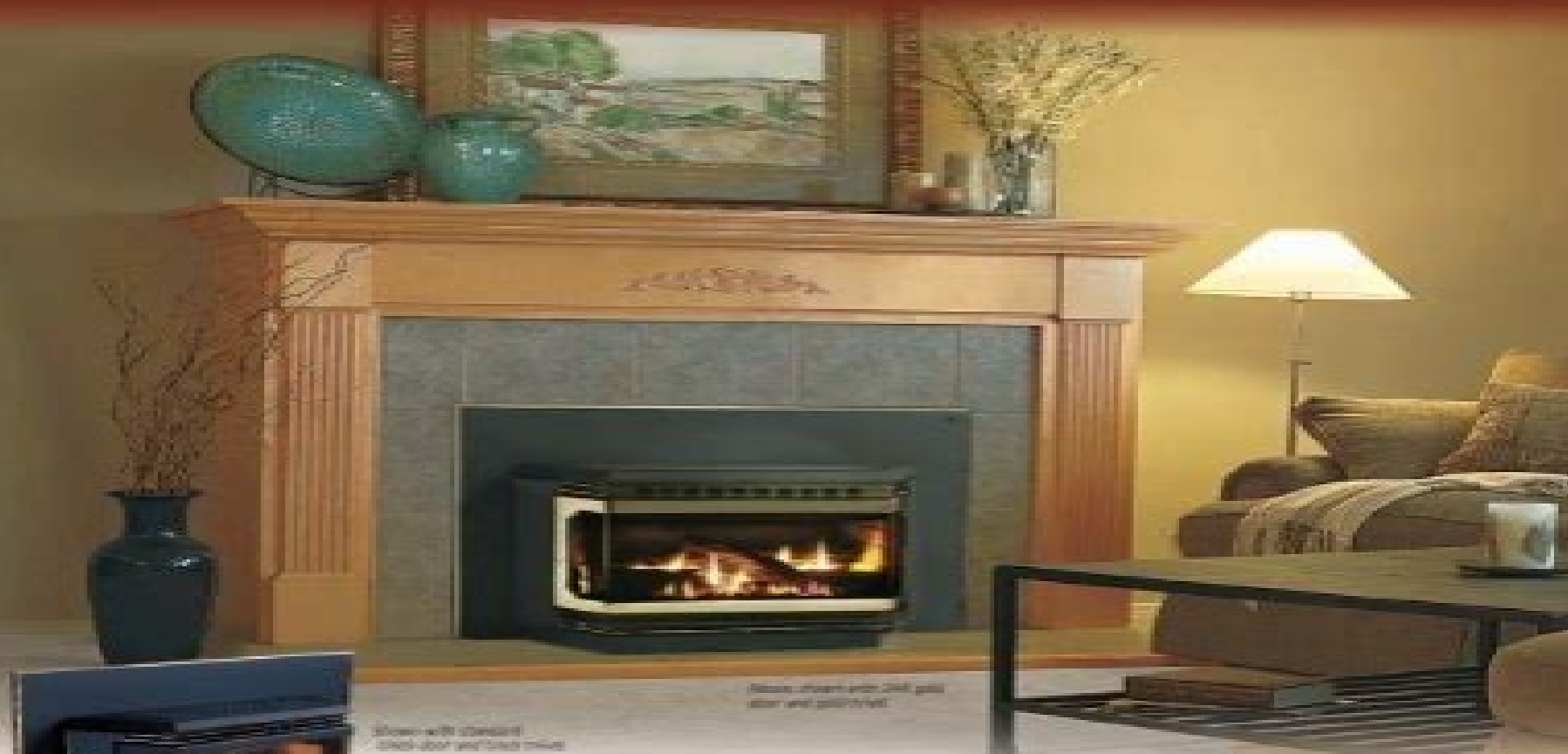
Shown shown with 24K gold door and gold trim