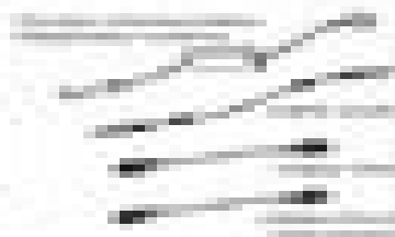
Fig. 11: 90°-Position