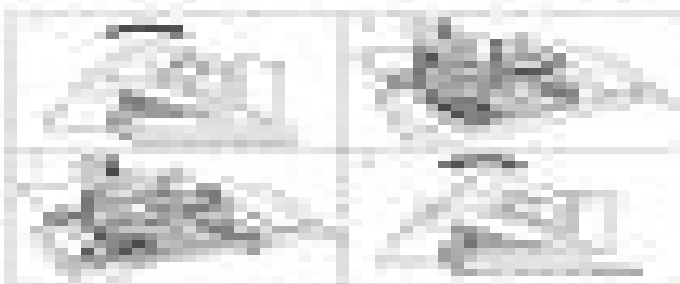
Figure 1: Project Site Views

4. Project Start Date: _____ 5. Project End Date: _____ 6. Project Budget: _____