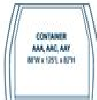
Position 1 - 10