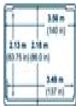
Main deck cargo door