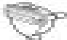
Figure 1-11 Power cable connection