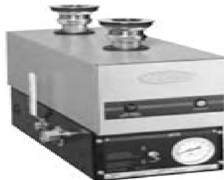
3CS-6 with optional temperature monitor