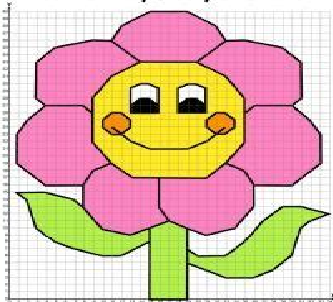
Flower Mystery Picture