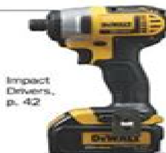
Impact Drivers, p. 42