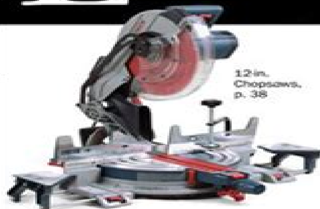
12-in. Chopsaws, p. 38