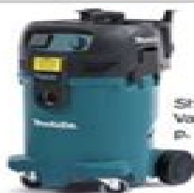
Shop Vacuums, p. 48