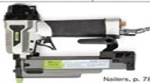
Nailers, p. 78