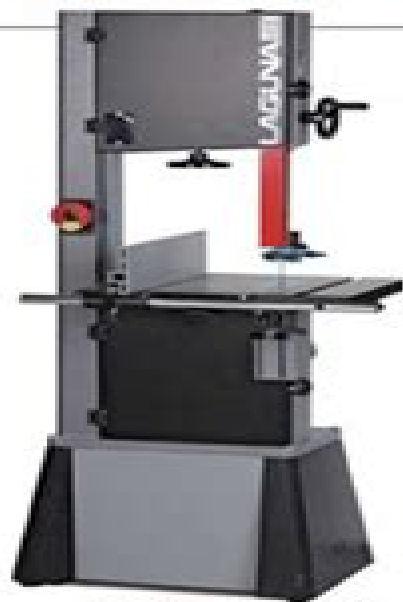
14-in. Bandsaws, p. 66