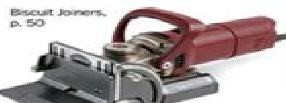
Biscuit Joiners, p. 50