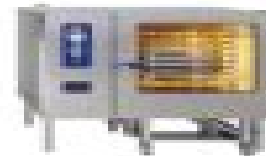
Genius T 12-21