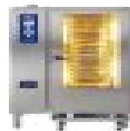
Genius T 20-11