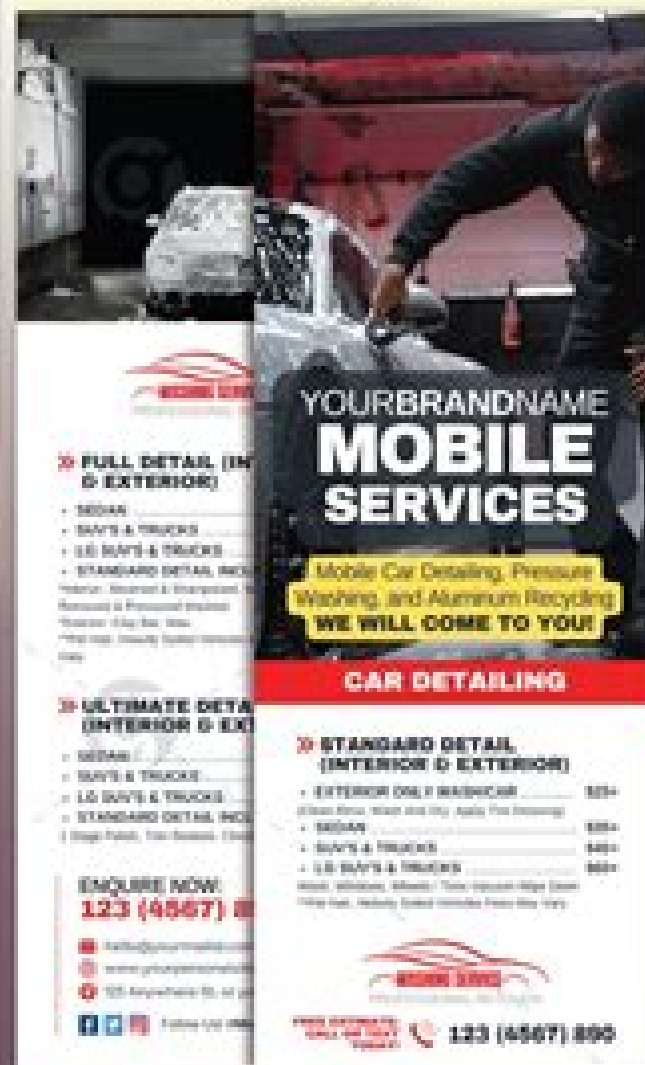
Door Hanger_4.25x11 inch