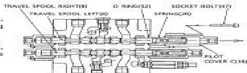
Fig. 2-3 Pulling out travel right and left spool (section BB)