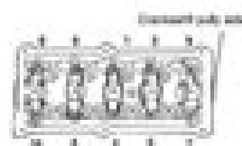
Correct only one

When hot : 70-75 Nm (700-750 kg.cm, 51-54 lb.ft)